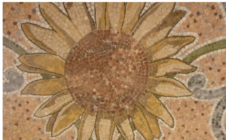
It turns towards the sun

(Ignatius' phrase for a particular way of seeing and doing things).