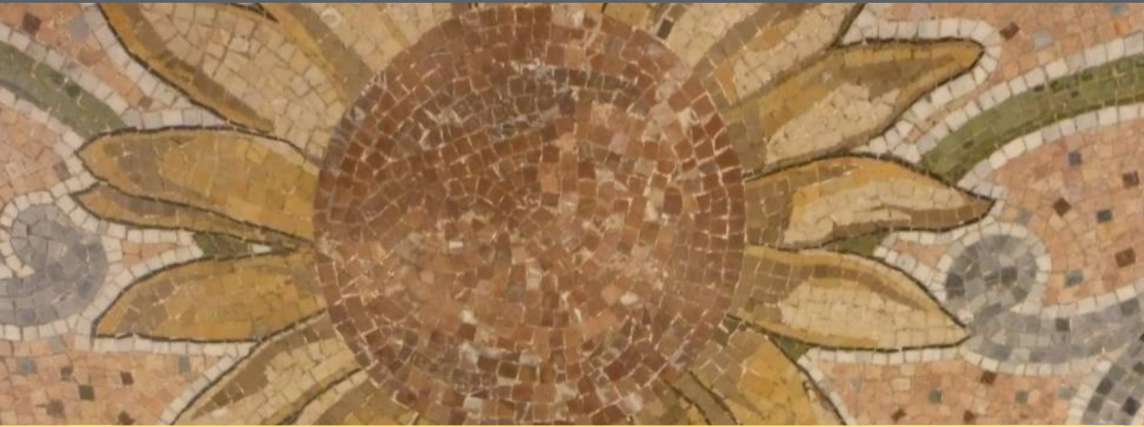
Sunflower (1922) by Martí Coronas SJ