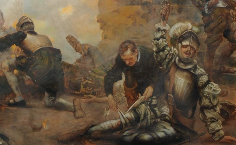
Ignatius falls at the battle of Pamplona, May 1521

Given the name Íñigo at his baptism, Ignatius was born at the margins: in the year 1491 just as the medieval was giving way to the renaissance; in the mountainous and inaccessible borderlands between the Spain of Emperor Charles V and its powerful rival, the kingdom of France; speaking the Basque language; the thirteenth child of a local aristocrat.