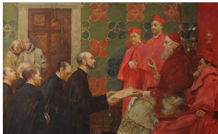
The Society of Jesus receives the Pope's approval, September 1540

It was from his rooms in Rome at the Red Tower, and later next to the little church of Santa Maria della Strada which the Pope had entrusted to the Jesuits, that Ignatius sent his great friend Francis Xavier to India, Sri Lanka, Borneo, Japan and China with the words, 'Go! Set the world ablaze' with the love of God. He sent Diego Laínez and Alfonso Salmerón to the Council of Trent as expert theologians. Peter Canisius was sent to defend the Catholic faith against the reformers in Germany.